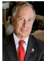
Michael Bloomberg Harvard Business School '66