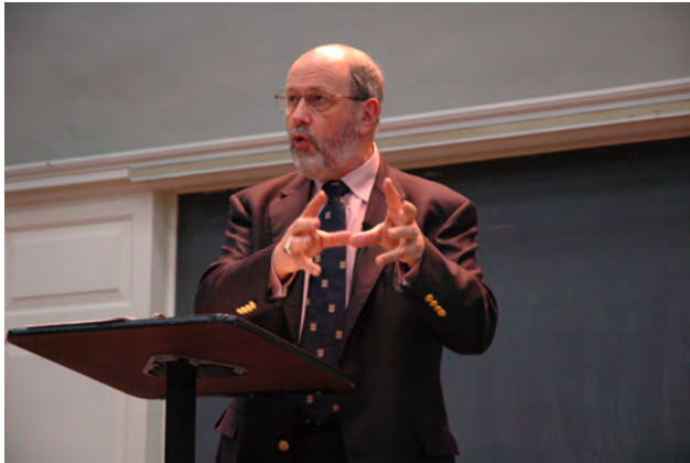
NT Wright speaking at Harvard

In 1692, Harvard drafted its motto, Veritas Christo et Ecclesiae . Truth for Christ and the Church. Now it is simply Veritas . Gone are references to Christ and the Church. InterVarsity helps students recapture the original vision of Harvard as a place where truth leads to Christ and serves the church, but also looks to the future, praying for God to do a new thing in our midst.