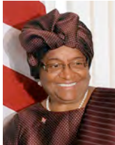
Ellen Johnson Sirleaf Former President of Liberia Kennedy School '71