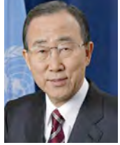
Ban Ki Moon Former U.N. Secretary General Kennedy School '85