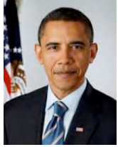
Barack Obama Harvard Law School '91

Harvard graduate students go on to shape our world: